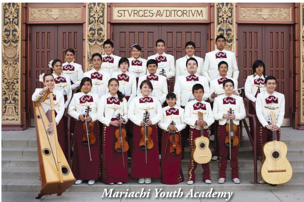
Mariachi Youth Academy

“Teach your students to read music. If you teach them a song, they will learn that song. If you teach them to read, they will learn a million songs.”